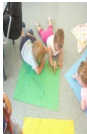
Drawing time in the babies room