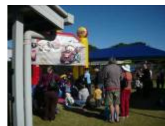
The jumping castle was a huge hit for all the children.