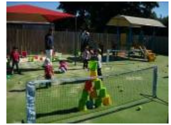
The children enjoyed the sports activities provided including tennis.