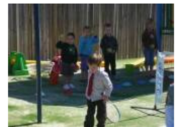
The children participating in the sports activities.