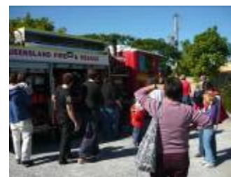
Big kids and little kids enjoyed the fire truck visit.