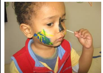
Self expression done through painting our own faces