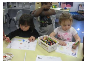
Free expression through crayon art