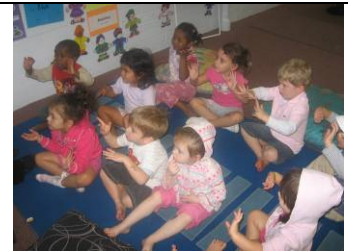
Mat session using number concepts