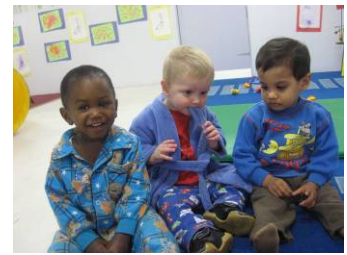
Sleepy fun on Pyjama day