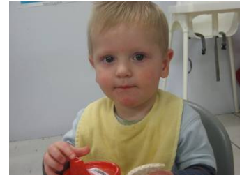
Yummy Food during meal times!