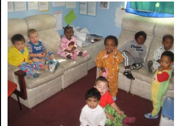
Watching a "Dental Health Movie" in our PJ's