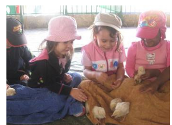
Playing with the farm animals when the farmyard came to visit