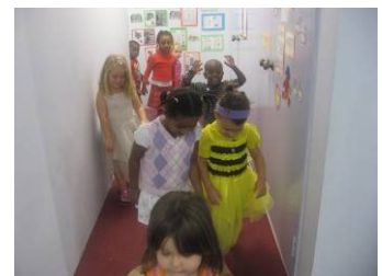
Going on Fairy hunt... "Follow the Fairy Dust"