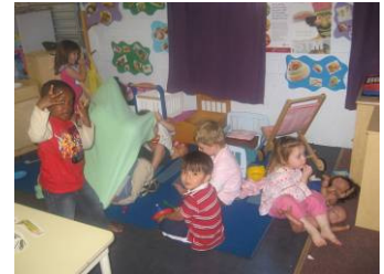
Dramatic Play fun with the babies