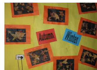
Natural Leaf Pictures