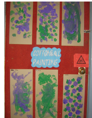
Cotton Bud paintings