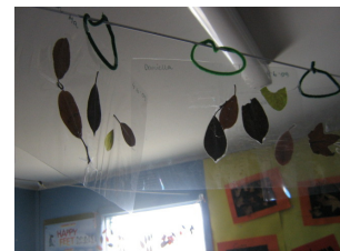
Natural Leaf Pictures