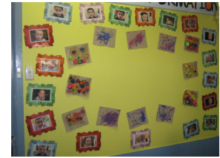
Toddlers Art Wall