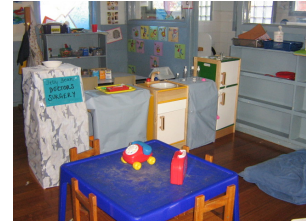
Jelly Bean Doctors Surgery