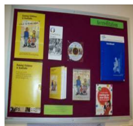
Accreditation Information Multilingual