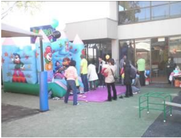
The children (and some of the adults!) had lots of fun on the jumping castle.